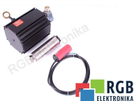
T6613-5KF AMPHENOL ADVANCED SENSORS

New AMPHENOL ADVANCED SENSORS T6613-5KF Tested and cleaned. 12 months guarantee Dedicated courier Delivery across Europe even in 15855